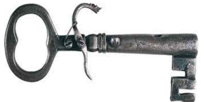
Continued next edition...

This example was a caplock key pistol made in Europe in the 19th century and is in 9mm