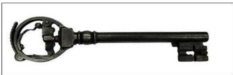
A 16th Century example.

First used in the 16th century, key guns allowed a jailer to keep his weapon throughout the entire extremely vulnerable process of opening a cell door, thus never leaving him unprotected. Well, all except for the times when he's actually using the key/barrel end of the pistol to disengage the lock. That's right, key guns weren't just shaped like keys to throw people off or disguise their nature as pistols -- they're both functional keys and functional pistols.